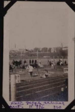
State High school 1961 120