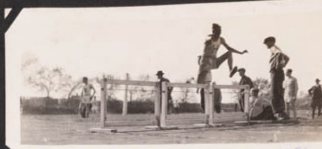
Relay had better relay in the land - 1921