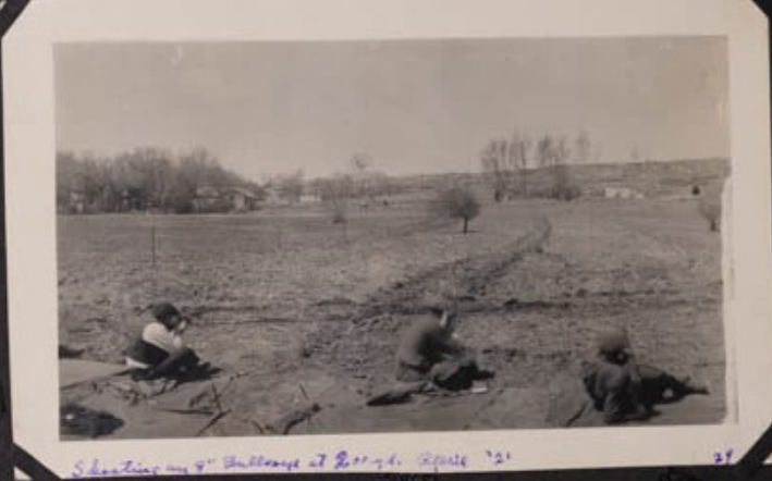
Shooting on 9" Ballgame at 200 yds. Range '21