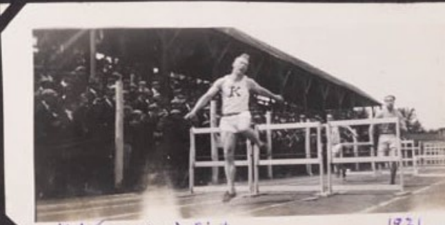
K.U. again in First