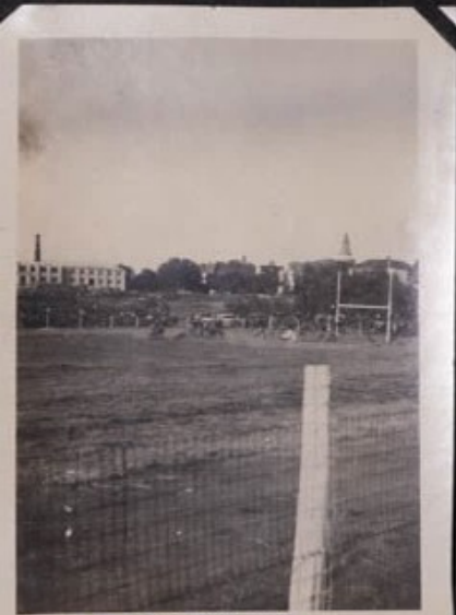
1930 - Hayes Normal 14 - 01 1930