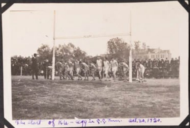
The start of K.K. - egg in S.S. run. Oct. 30, 1920.