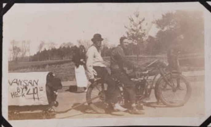
LYNCH and DOWNEY '22