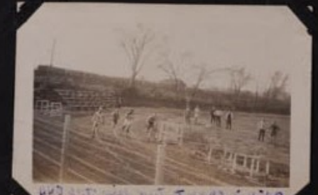
493 State High school 1961