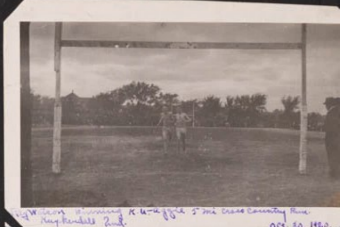
Big Wilson running K.K. - egg 5' mile cross country race Hay Kendall 2nd. Oct. 30, 1920.