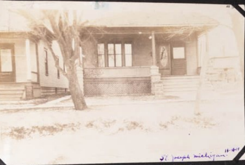
St. Joseph, Michigan 11-4-19 Taken on my way to Kansas. my Aunt's Home