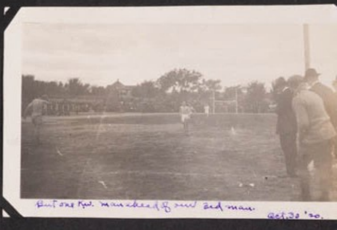
But one for man who is 1/2 and 2nd man.