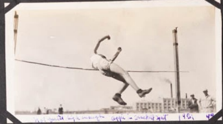
High jump by a student - 4'11" - 1921