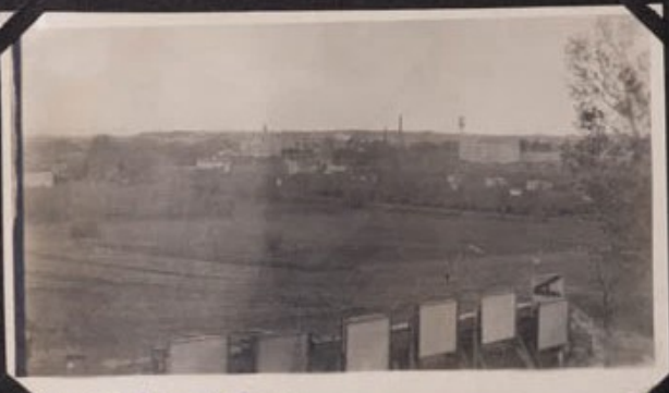
College from rifle range