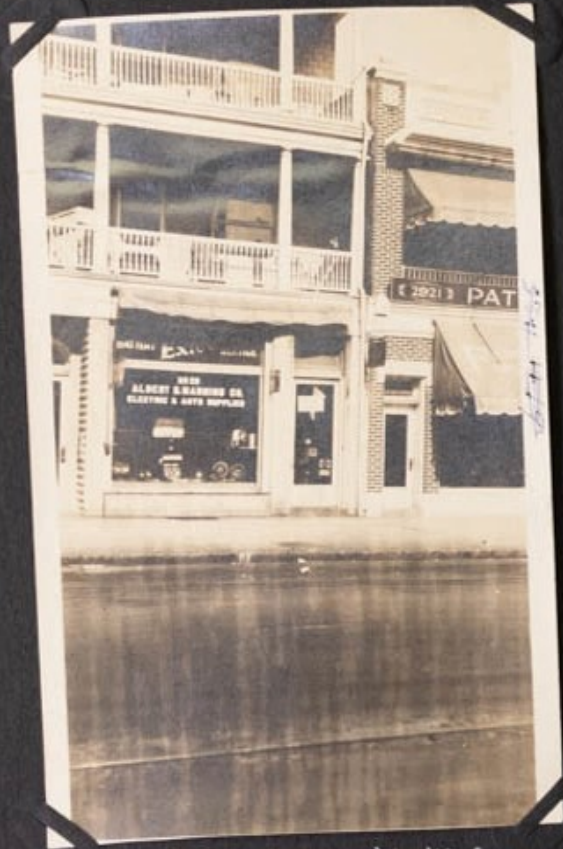
I worked at 2925 Atlantic Ave, Atlantic City, N.J. in 1919