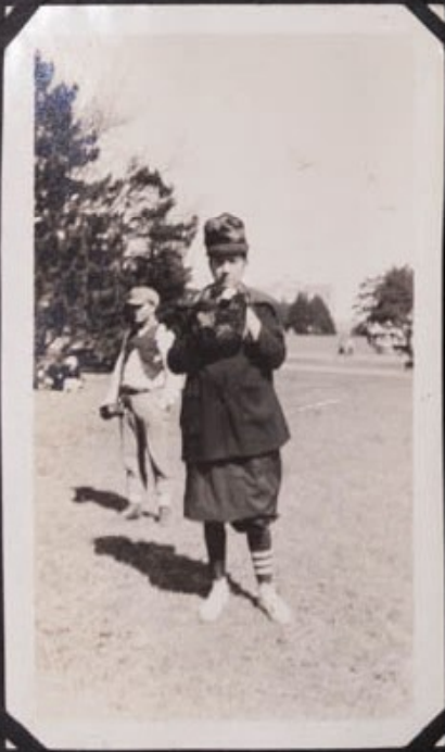
S.S. Pleydell 3-15-21