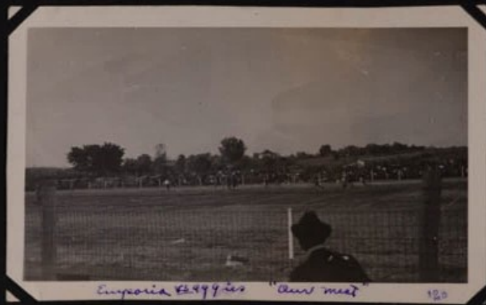
Emporia 499-ies "ant meet" 120