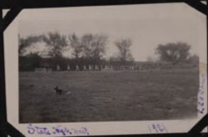
State High school 1961