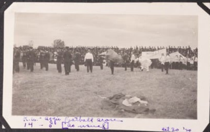
K.K. - egg football game 14 - 0 [do name]