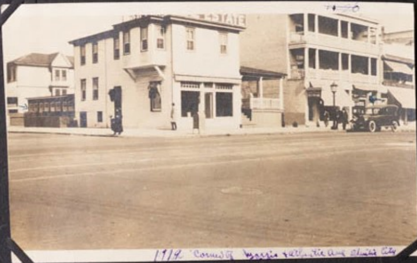
1919. Corner of Morris & Atlantic Ave Atlantic City