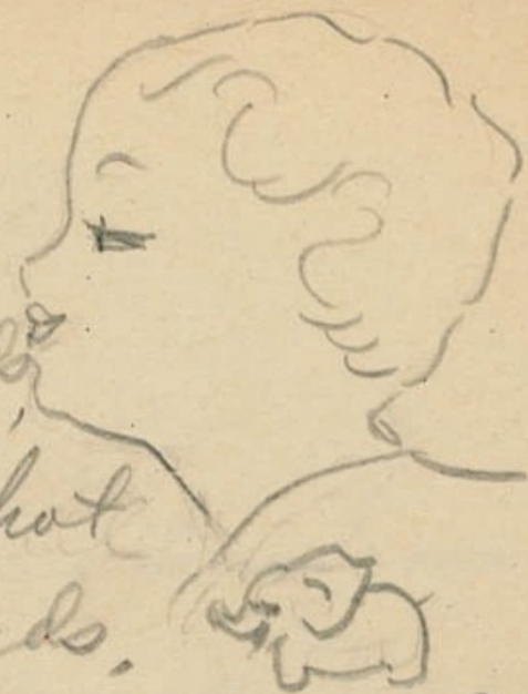
The Baby Elephant

Kind hearts are the gardens Whose fruits are good deeds, But I am very fearful that Mines full of weeds.