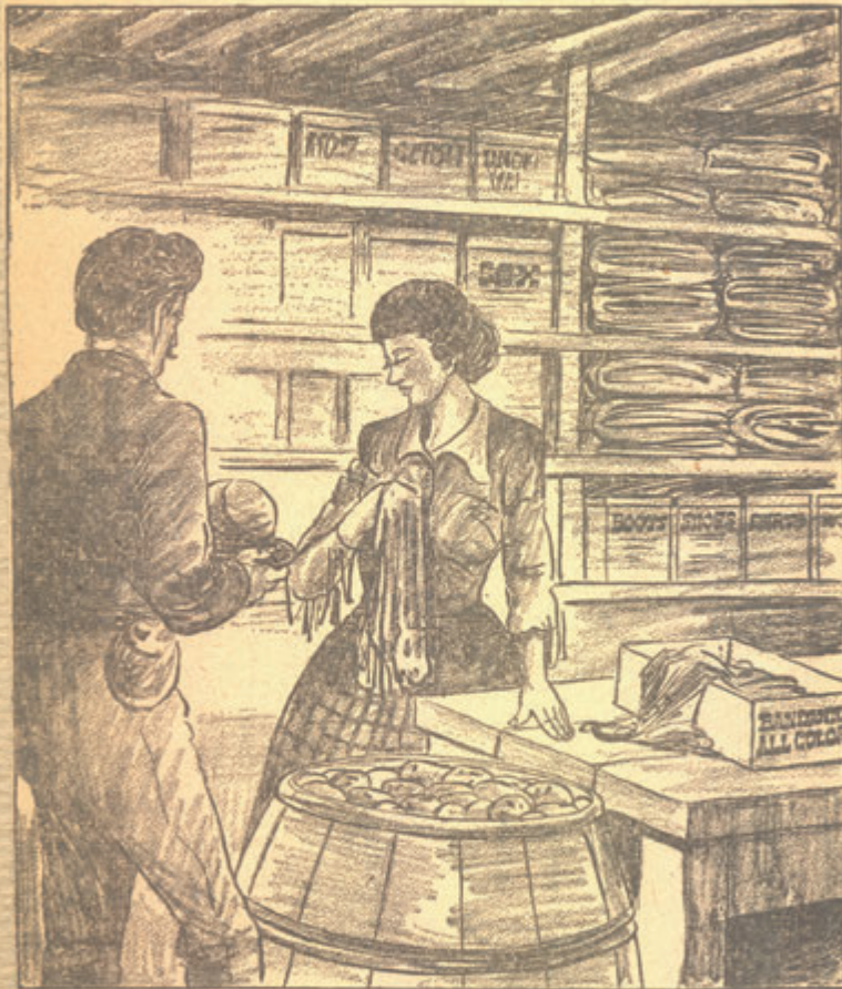
(Wichita Historical Panel No. 70)