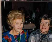
BENEFIT LUNCHEON AT BRANDY'S Thursday, Oct. 9, 1987