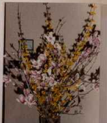
Centerpiece-table Saucer Magnolia