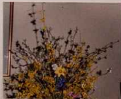
Floral arrangements of spring flowers