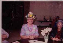
General views of :

Luncheon & Meeting Rotariane - the Wichita Gardens 701 N. Jackson April 30, 1987 12:30PM $5.00