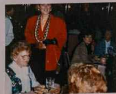
LUNCH - BRANDY'S Fashions by Henry's Benefit for BOTANICA